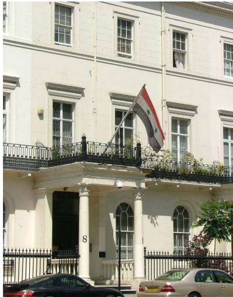
The Syrian embassy in London.